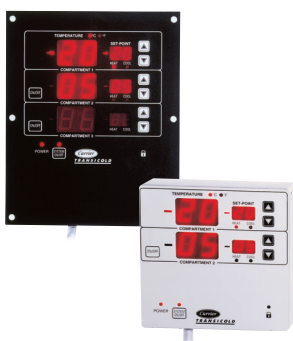
Easy to use slimline control panels, with adaptable positioning and proven reliability.

4 standard configurations are available, using our new generation of ultra-slim evaporators for total flexibility and optimised loading. Other configurations are available upon request.